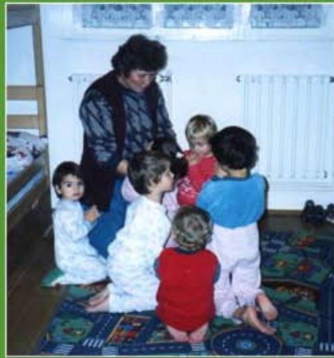
"Bedtime Prayers, September 1999: From the very first nights spent at the House of Hope, we have been seeking the Lord for a forever family for the children there."

I t is with a heavy heart that we share with you that we have decided to close one of our children's homes. Just as many Americans are tightening their belts for 2009, we have tightened our belt at Global Hope. In November, we consolidated our ministry in Romania from three homes to two in order to trim our budget by 20%. That means our two remaining homes each have more mouths to feed, more homework to check, and more foreheads to kiss goodnight; but it also means that we can be better stewards of the money that you donate. In the midst of the changes, we lost not one, but two sets of houseparents. Our dedicated and loving staff is working in around-the-clock shifts to provide for the needs of the 10 children who live at the Steven's House, however,